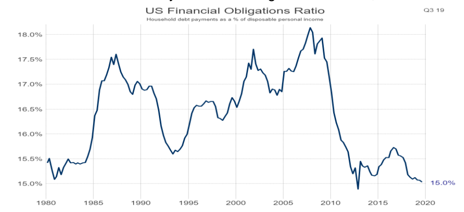
Past performance is no guarantee of future results. Shown for illustrative purposes.