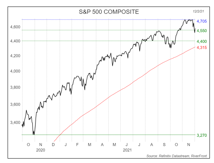
Shown for illustrative purposes. Not indicative of RiverFront portfolio performance.

The size of the market's rebound caught many by surprise. Given the scale of the pandemic, with its multiple waves and variants, it is safe to say that few would have foreseen the magnitude of the recovery in stock prices, profits, and profit margins. If ever there was a case for our mantra of 'Process over Prediction', this has been it.