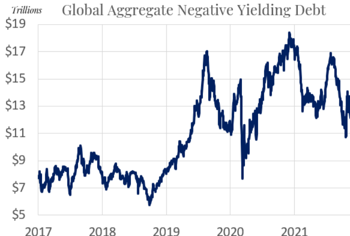
Shown for illustrative purposes. Not indicative of RiverFront portfolio performance.

Real yields, which is the return an investor gets for loaning their money to the government for a period of time, continue to fall despite rising inflation expectations. In fact, the yield on TIPS (Treasury Inflation Protection Securities) are negative throughout all maturities (see chart on page 1). Nominal yields appear to be pricing in growth slowing slightly with inflation dissipating. Regardless of which market view is correct, fixed income still is not attractive to us. Negative real yields do not help the bond market but serve as a catalyst for higher prices in risky assets, like stocks, as investors seek higher returns. Additionally, with most of the world having negative real yields (see right chart), US real yields are relatively attractive causing foreigners to gravitate to the US bond market. This added demand will push up the US dollar.