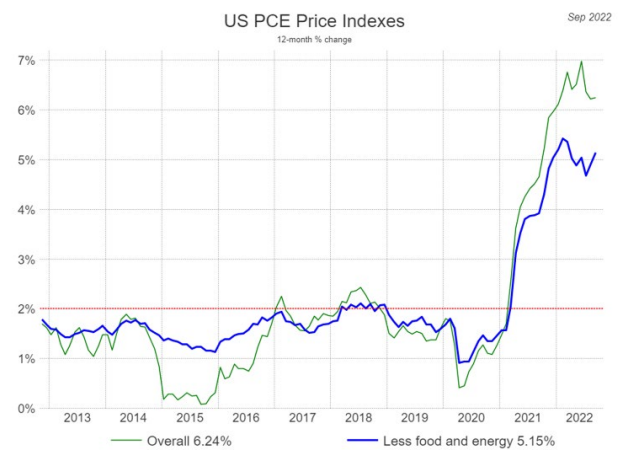
Source: Refinitiv Datastream, RiverFront. Data monthly, as of September 15, 2022. Shown for illustrative purposes only. Past Performance is no quarantee of future results.

the US Personal Consumption Expenditures Price Index (PCE). The most recent overall reading came in at 6.24%, and 5.15% when food and energy prices were excluded (chart, right). The Federal Reserve is known to prefer the PCE Index to the Consumer Price Index (CPI) because the PCE takes into account consumer behavior, such as substituting for less expensive items, versus simply measuring price movement. The Consumer Price Index for October will be released this week. The September