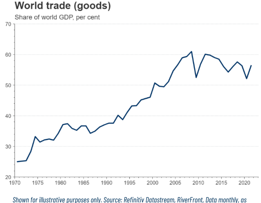
CHART 6: GLOBAL TRADE STAGNATING OVER PAST DECADE

Shown for illustrative purposes only.