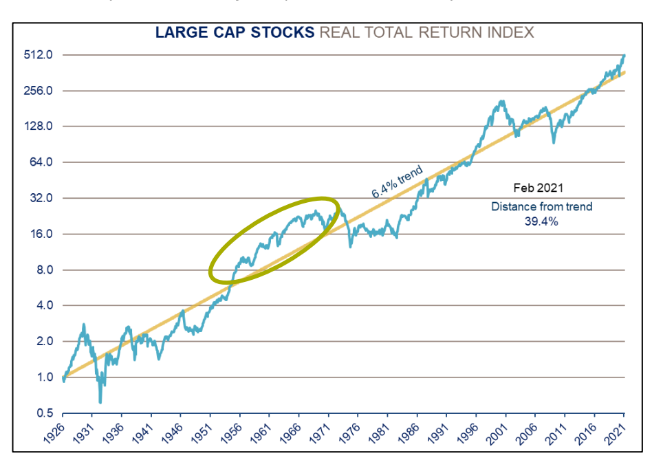
Source: RiverFront Investment Group, calculated based on data from CRSP 1925 US Indices Database ©2021 Center for Research in Security Prices (CRSP®), Booth School of Business, The University of Chicago. Data from Jan 1926 through Feb 2021. Trend, according to Price Matters® is the slope of an exponential growth function that closely tracks a real (inflation-adjusted) long term Index for that Asset Class. Distance from Trend is the distance of the trend-line relative to the current index level expressed as a percentage. Real Return is the annual percentage return realized on an investment adjusted for inflation. The chart above uses a logarithmic scale. Line movements will be dampened/subdued based on the exponential y-axis. CRSP (1-2) Cap- Based Portfolio definition may be found in disclosures. Past performance is no guarantee of future results. It is not possible to invest directly in an index. Shown for illustrative purposes only and not indicative of RiverFront portfolio performance.

Mean reversion's 'Achilles Heel' comes if one continues to use a trend that is no longer valid and so we believe it is important that our team is constantly working to validate trends via fundamental analysis. The concept of