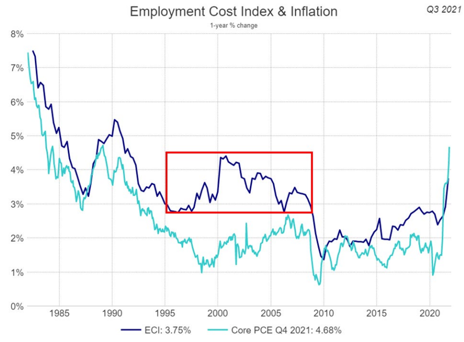
Chart 2. Rapid Acceleration in Wages and 'Core' Inflation

Chart shown for illustrative purposes only. See disclosures for definitions.