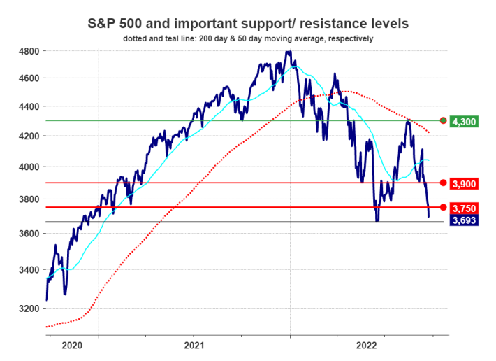
Data monthly, as of 09.26.22. Chart shown for illustrative purposes. Past performance is no guarantee of future results. Not indicative of RiverFront portfolio performance.

Stocks are down significantly for the year and, not surprisingly, so is investor sentiment, which is now at pessimistic extremes. Given such pervasive pessimism among both stock and bond investors, we believe the risk of swift reversals are