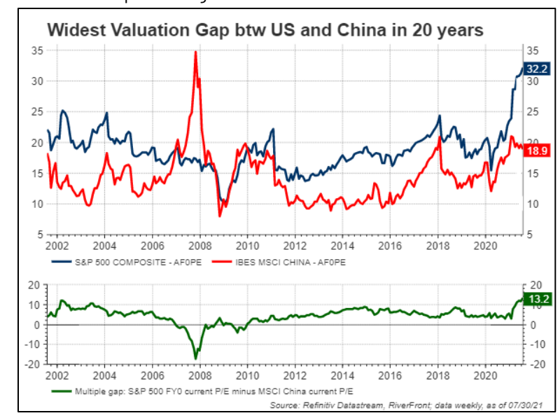
Past performance is no guarantee of future results. Shown for illustrative purposes. Not indicative of RiverFront portfolio performance. Index definitions are available in the disclosures.

These shareholders going forward may have to continue to assign a consistent 'uncertainty' discount to Chinese shares in these areas, regardless of structural growth and profitability prospects. For comparison's sake, the valuation of the MSCI China stock index – a Chinese index widely-followed in the West, which is roughly a third technology stocks and has behaved similarly in the selloff to pure offshore Chinese indices. MSCI China is currently trading at the cheapest valuation discount – over 13x multiple points – relative to the US bellwether S&P 500 index in 20 years, as judged by trailing year price-to-earnings ratios (see bottom chart, right). However, we think it's too early to try and 'bottom-fish' in these China names, as this uncertainty is unlikely to abate anytime soon.