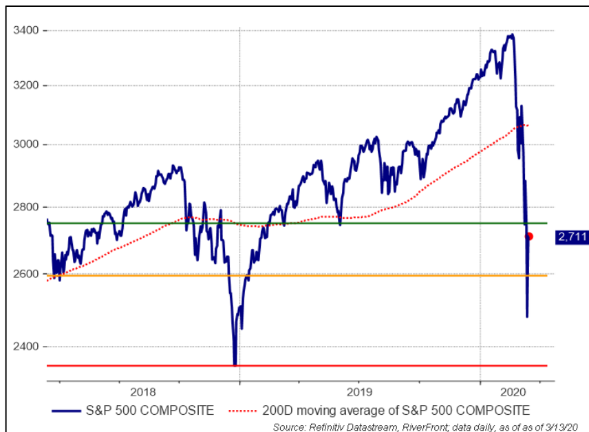
Shown for illustrative purposes. Past Performance is no guarantee of future results. Not indicative of RiverFront performance.

This is a phrase we use a lot around RiverFront’s HQ when evaluating the technical backdrop of markets. We believe that when key technical support levels are breached in a market selloff, they then become a psychological ceiling for markets. Thus, we would like to see the S&P 500 be able to hold 2595 (orange line, on chart right) and ideally also 2750 (green line, the June 2019 low) on the upside before starting to consider the bottoming process to be in full swing. 2870 may also prove to be tough resistance on the upside. Its’ worth remembering that market bottoms are generally a process, not an event; often times, markets retest or even make new lows before the bottom is solidified. On the downside, we are now watching 2350 (red horizontal line, the December 2018 low) as the next major level of support, should 2595 fail.