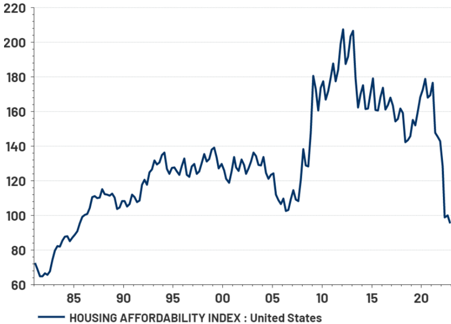
Data quarterly as of November 15, 2022. Chart shown for illustrative purposes.