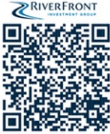
RiverShares Global Balanced Constrained

RiverFront does not earn any account-level fee with respect to any RiverShares accounts, including from a Sponsor Firm. Clients who access RiverShares portfolios through a Sponsor Firm, however, will typically pay additional fees to the Sponsor Firm. Clients should speak to their Financial Advisor for more information on such fees, as they may vary among Sponsor Firms.